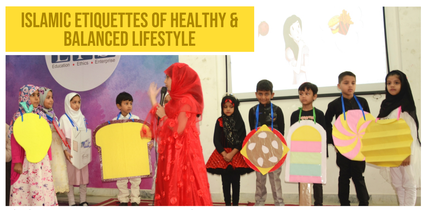
"A healthy body and mind enable us to perform ourdaily duties with ease and improve ouroverall performance as a True Believer."